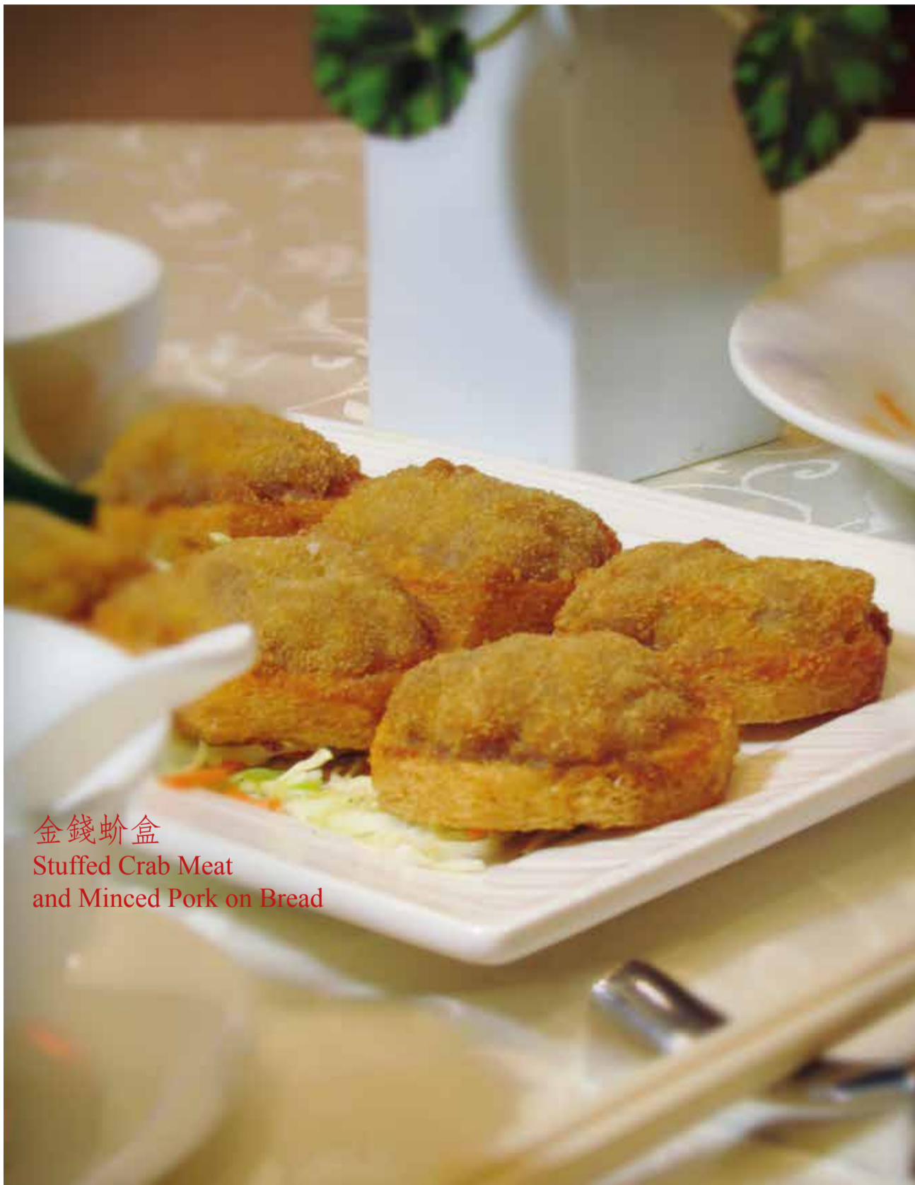
金錢蚶盒 Stuffed Crab Meat and Minced Pork on Bread